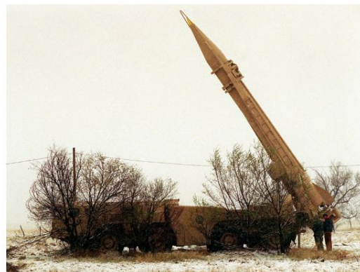
Dynamic PvE Server